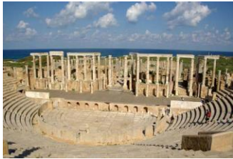
Aqueduct and Amphitheater