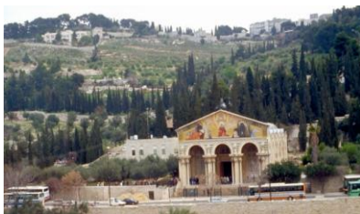
Mount of Olives