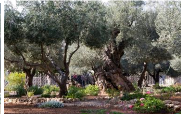
Garden of Gethsemane