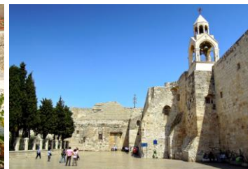
Church of Nativity