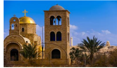
Qasr El Yahud